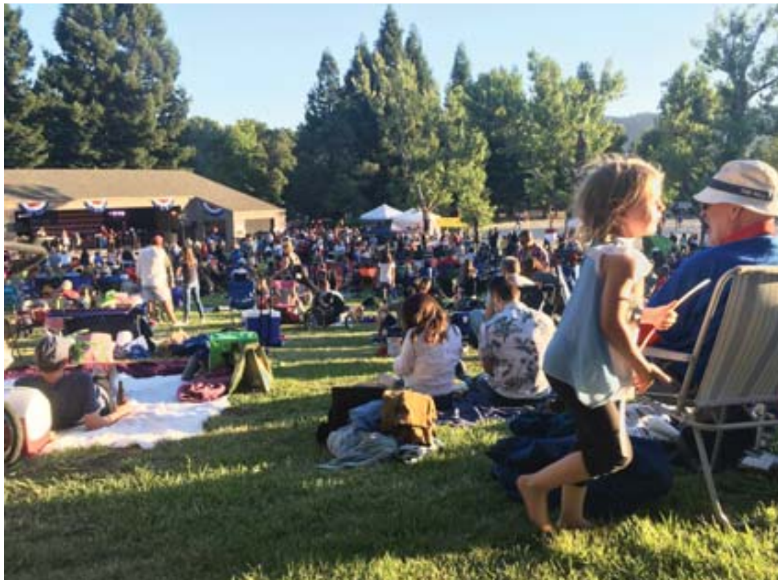
At last year's Moraga concert