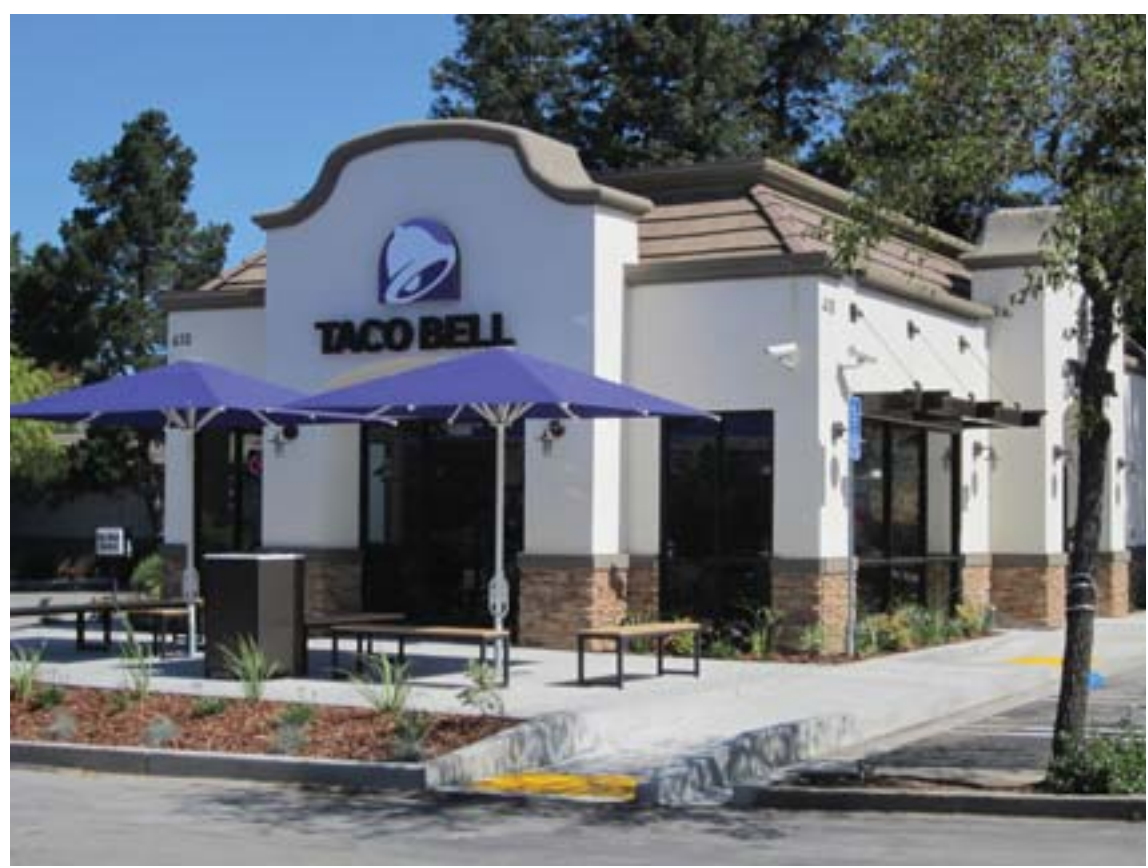
Taco Bell in Rheem Center open for business